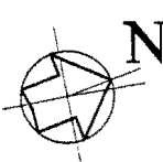
Floor / Site Plans / Landscaping Plan scale 1:100